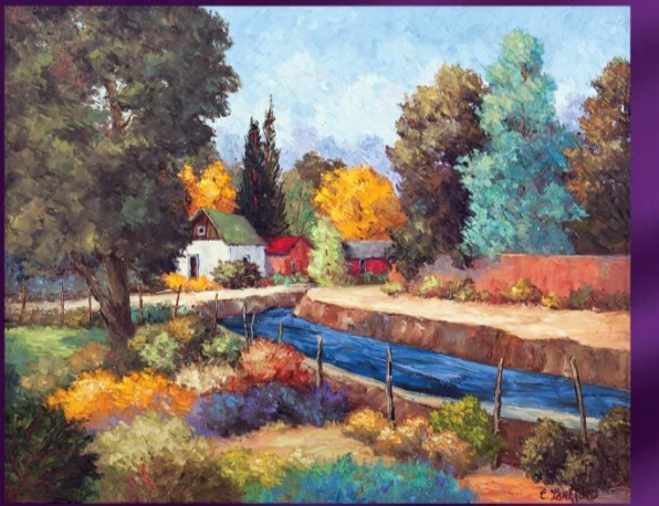
Mesilla Valley Canal