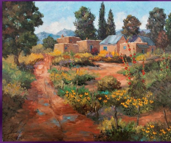
Wildflowers Along the Way