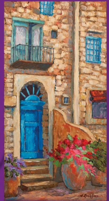
Blue Door in Capri