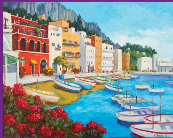
Isle of Capri