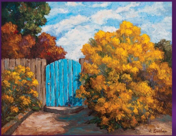
One Fine October Day