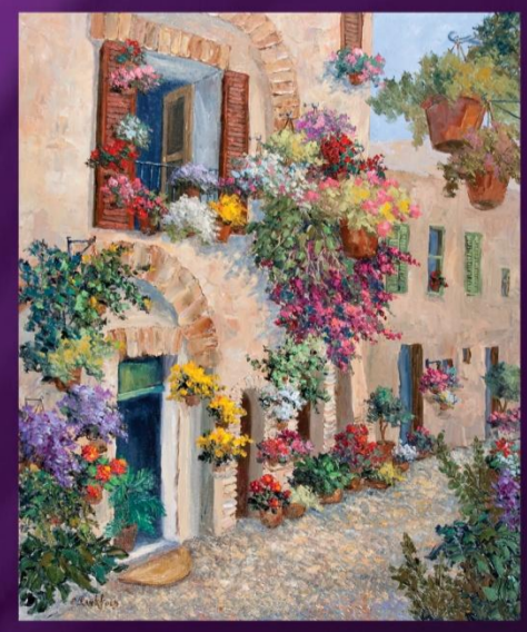
La Strada Dei Fiori

Represented in Albuquerque by Weems Gallery