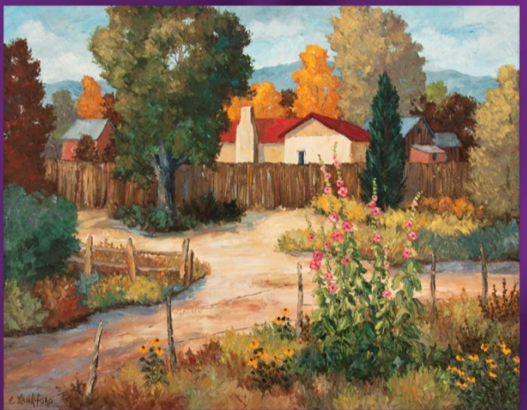
New Mexico Compound