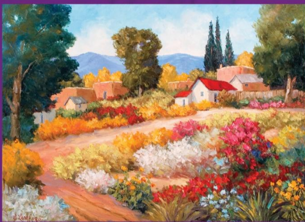
New Mexico Pathways