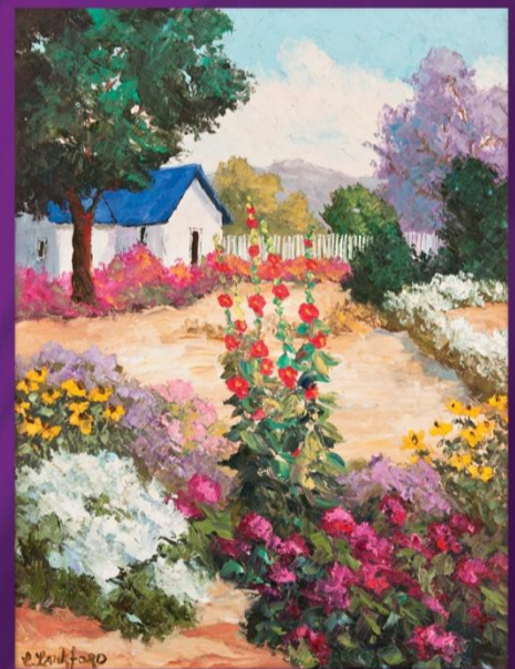
Old Stone Farmhouse